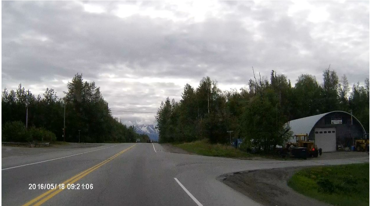
Eastbound on Bogard Road