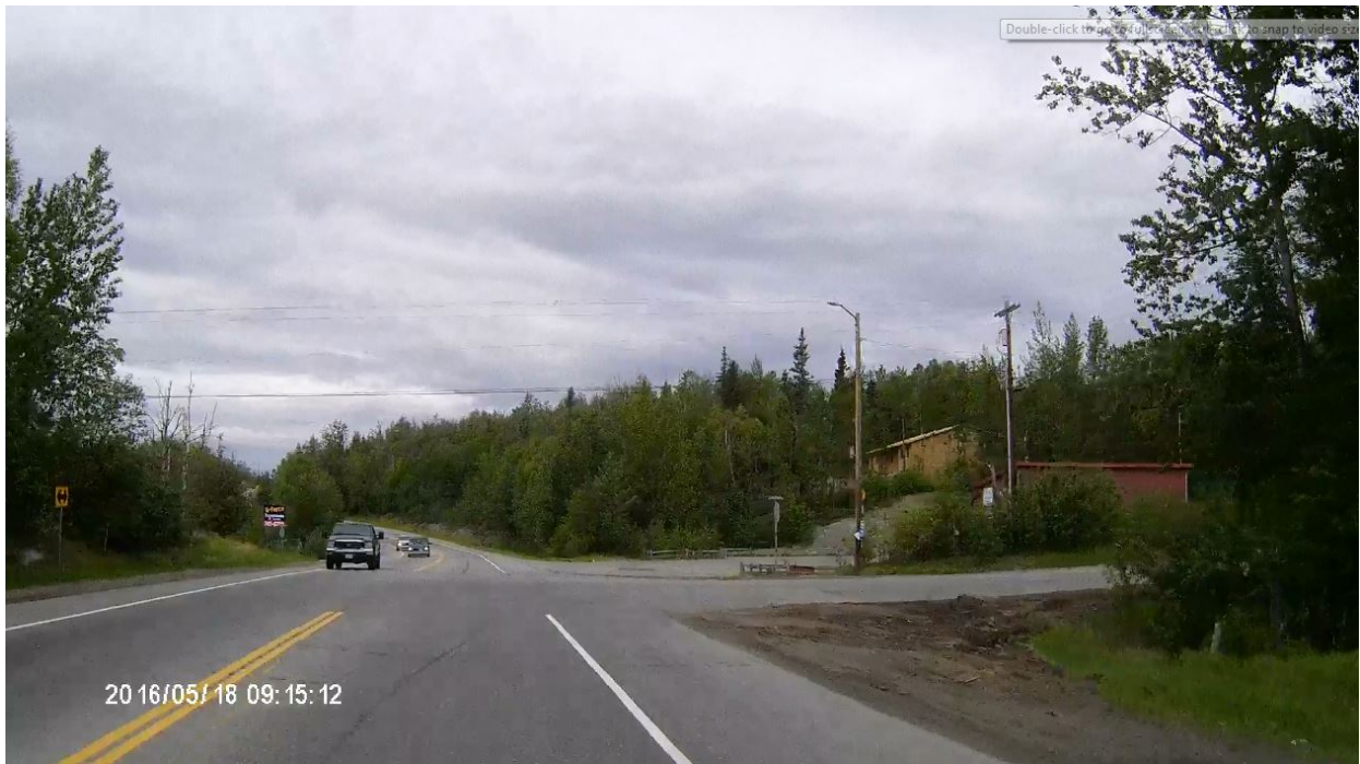
Westbound on Bogard Road