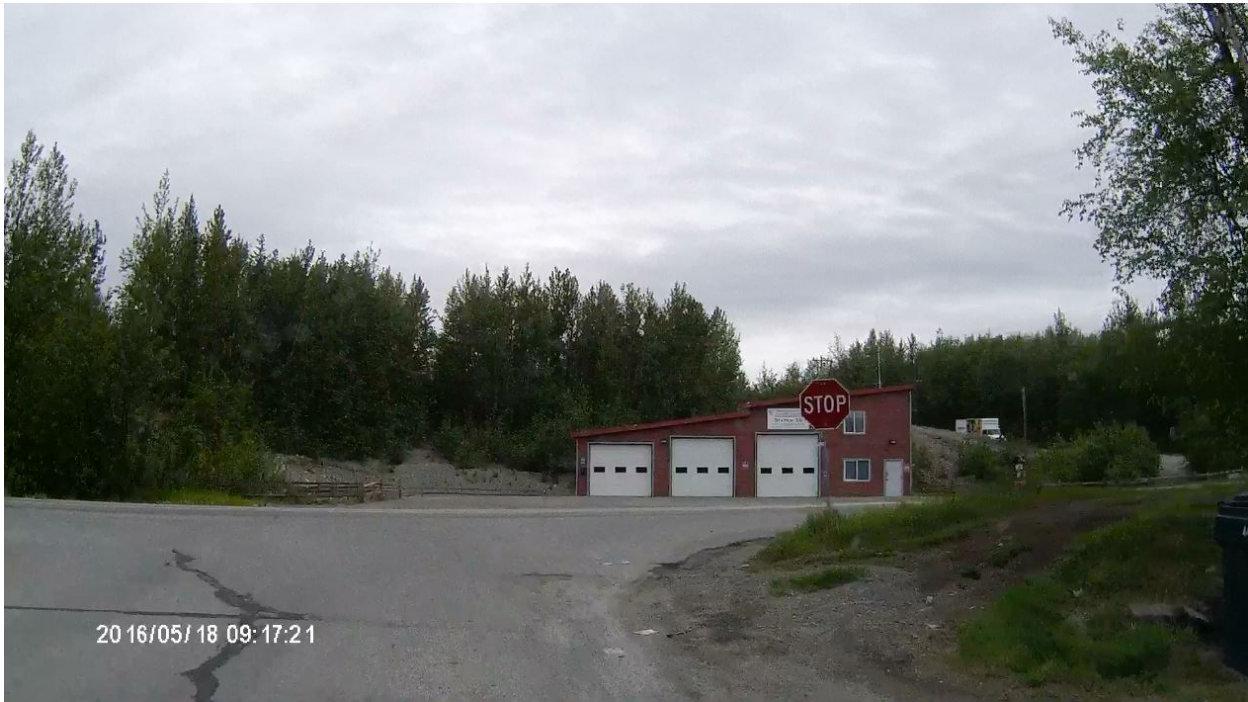
Northbound on Greenforest Drive