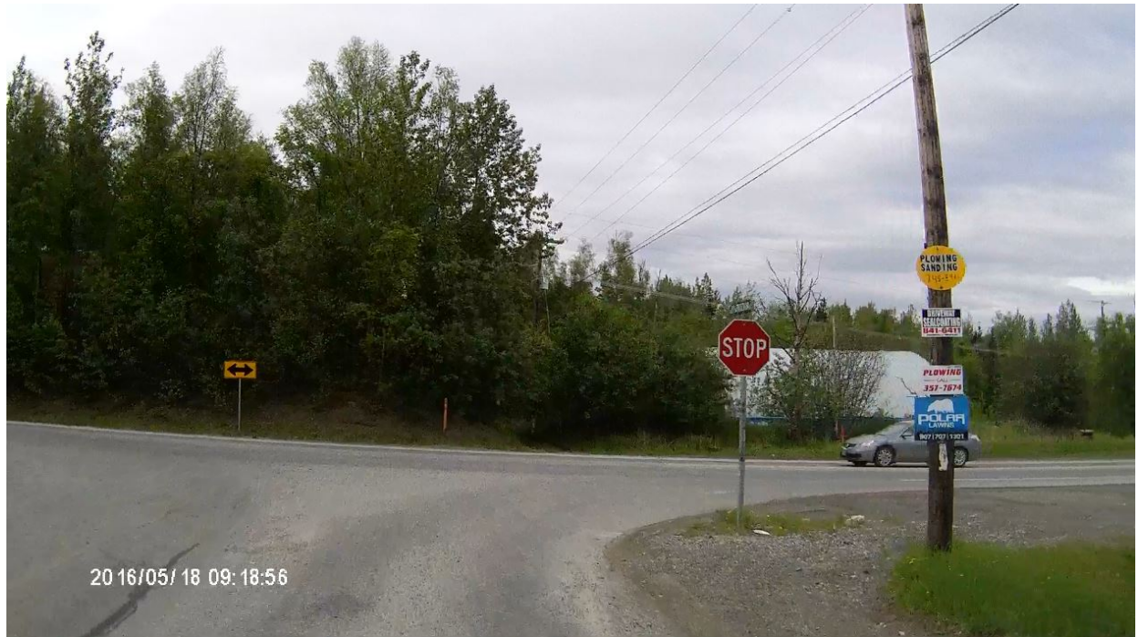
Southbound on Engstrom Road