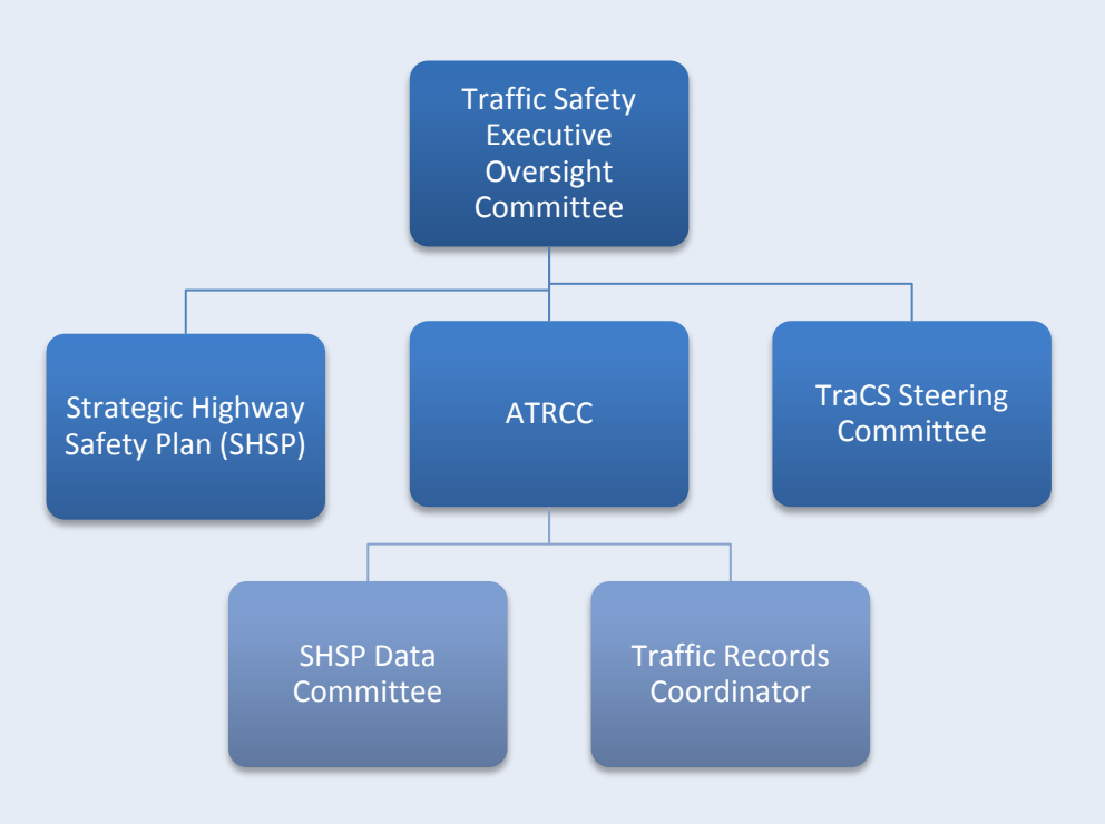
Figure 3. Ideal Tiered Alaska Traffic Records Oversight